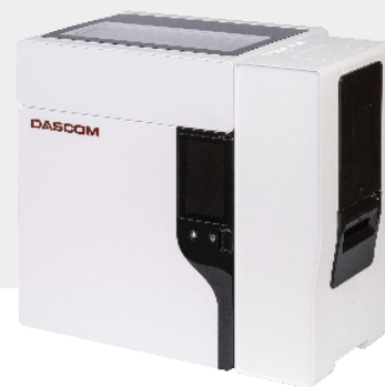
Double bin model

DASCOCM GB Ltd Hart House, Priestley Road Basingstoke | Hampshire RG24 9PU | ENGLAND Tel.: +44 1256 355 130 | Fax: +44 1256 481 400 info.gb@dascom-com | www.dascom.co.uk